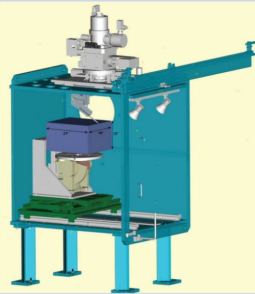
Above models illustrate a weld/EBAM build envelope with wire feed adaptation and five axes of part motion (X,Y,Z,Rotary/Tilt).

* The actual part envelope is based on added machine options and travel range requirements for a given component. Also, special chamber sizes can be designed specifically to optimize the work or part envelope for your application.